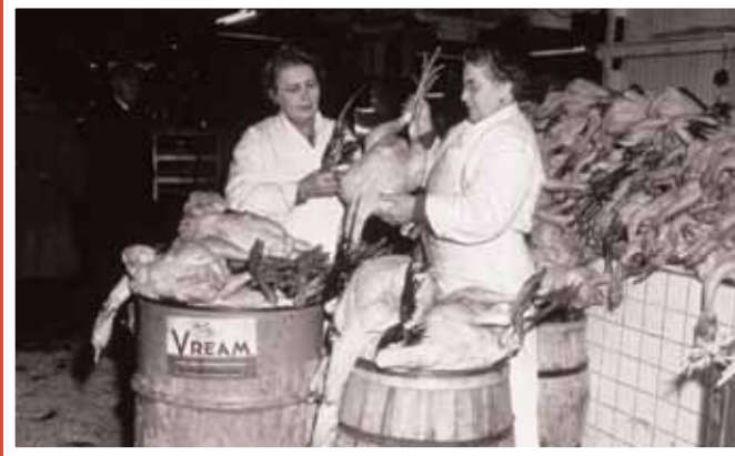
Above: Poultry stand in Reading Terminal Market, circa 1930s.

In 1892 the Reading Railroad opened the Reading Terminal Market below the tracks of their massive new train shed. The 78,000 square foot Market held nearly 800 spaces for vendors and was touted as the greatest food market in the world.